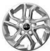
R16 - 40.62 cm (16") Steel Wheel with Full Size Wheel Covers