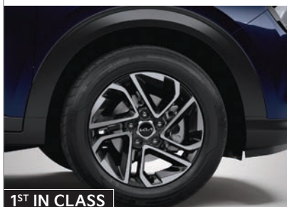
R16 - 40.62 CM (16") DUAL TONE CRYSTAL CUT ALLOY WHEELS

Chiselled to stun and enhance the muscular appeal, the two-tone finish provides a sporty and premium look.