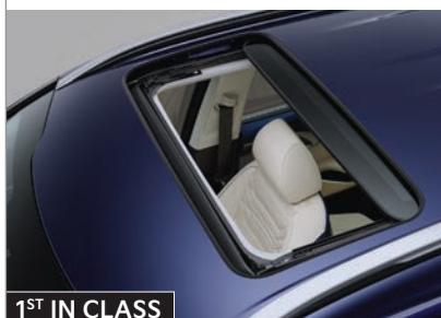
SKY LIGHT SUNROOF

Think of it as your portal to a different world.