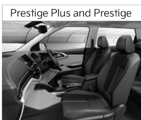
Prestige Plus and Prestige

OPULENT Two Tone Triton Navy & Beige Interiors