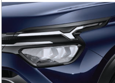
STAR MAP LED DRLs WITH CROWN JEWEL LED HEADLAMPS

Inspired by constellations, they lend a distinctive visual edge through sleek and avant-grade design.