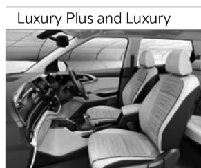
Luxury Plus and Luxury