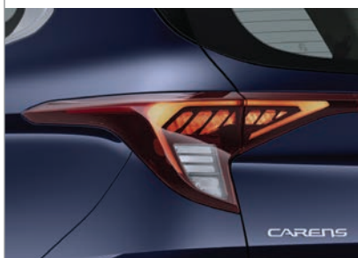
STAR MAP LED TAIL LAMPS

Form meets finesse with breathtaking aesthetic appeal, inspired by a million stars.