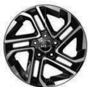
R16 - 40.62 cm (16") Dual Tone Crystal Cut Alloy Wheels