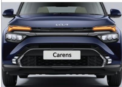
KIA SIGNATURE TIGER FACE WITH DIGITAL RADIATOR GRILLE

Refreshingly modern look grabs attention with right amount of contrast and attitude.