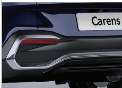
CHROME REAR BUMPER GARNISH WITH DIAMOND KNURLING PATTERN

Sophisticated pattern cast in chrome makes the rear looks stunning.